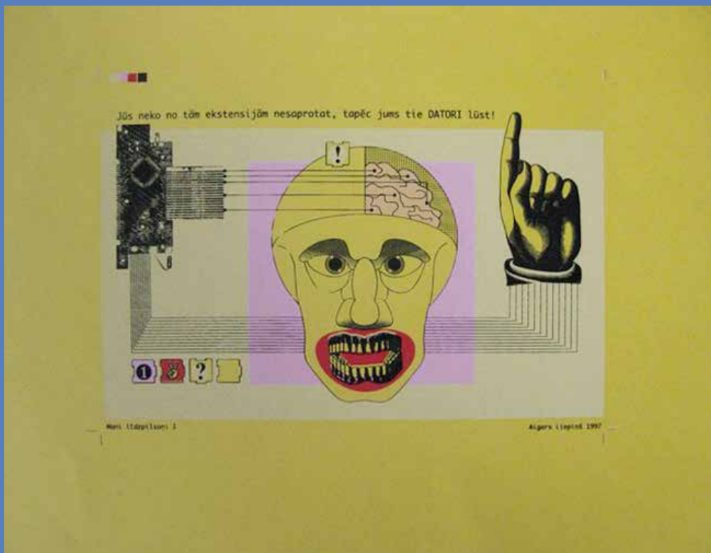
Aigars Liepiņš, 'Extentions, extentions, extentions!', Screen print on paper, 16x13", 1997. Available prints in different colours

Peepletree Art Gallery 269, 17th Cross, Sadashivanagar, Bangalore, 560080, India. Working hours: Tuesday - Sunday 11AM-7PM, Monday - closed info@peepletree.in www.peepletree.in (+91) 9845753937