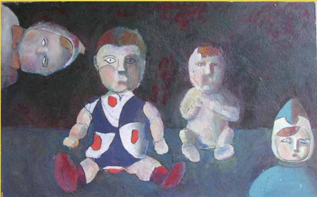
'Weird Dolls' Oil on cardboard, 28x19", 1990ties